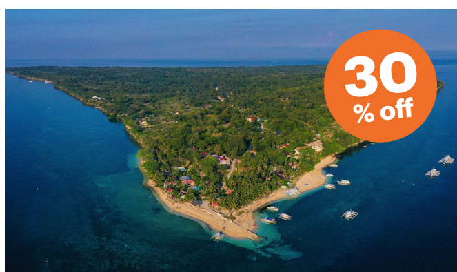
Pura Vida Cabilao (CBC) Dive Resort Group policy 7+1 FOC, breakfast included