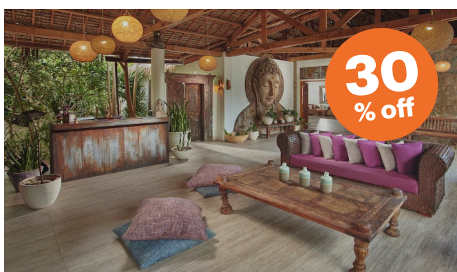
Ocean & Buena Vida Resorts Malapascua Group policy 7+1 FOC, breakfast included