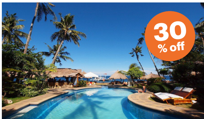
Pura Vida Dauin Beach & Dive Resort Group policy 7+1 FOC, breakfast included

Valid in Sea Explorers Dauin, Cabilao & Malapascua