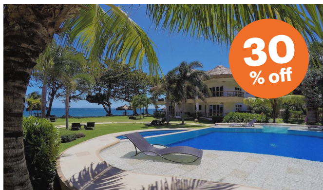
Vida Homes Condo Resort Group policy 7+1 FOC, breakfast included